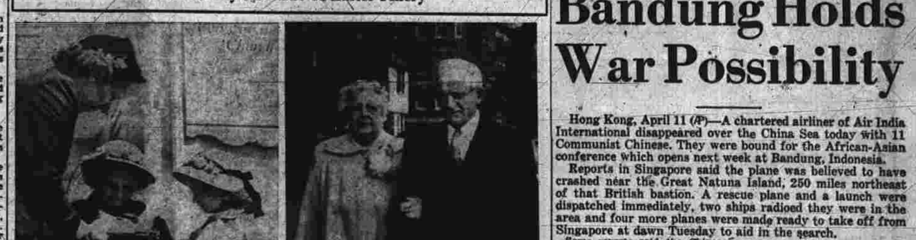
Part of Sunday's Parade of Easter Finery